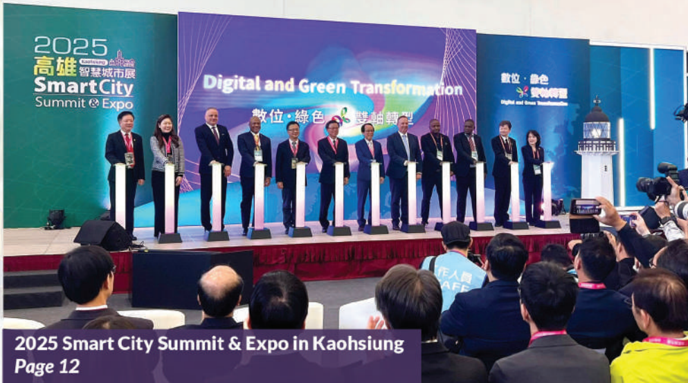
2025 Smart City Summit & Expo in Kaohsiung Page 12