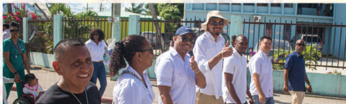
Child Stimulation Month Parade 2025 Page 6