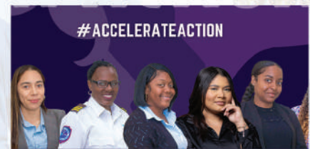
2025 Women in Action Series Page 17