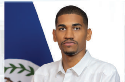
New Deputy Mayor Page 8