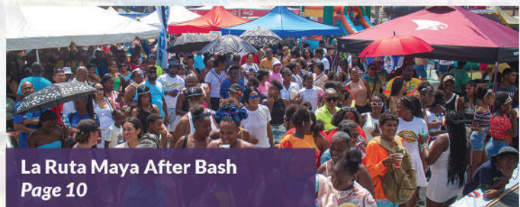
La Ruta Maya After Bash Page 10